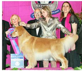
Best BBE, Vegas, Golden retriever